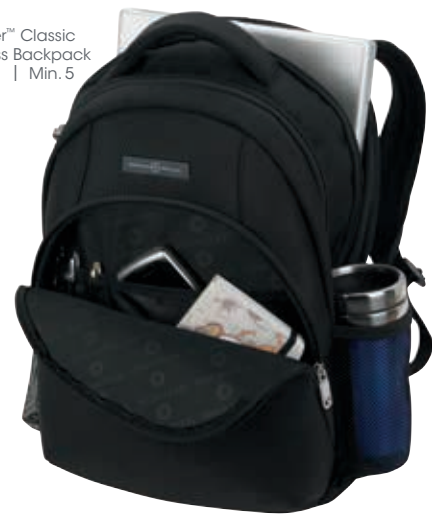
Sheaffer™ Classic Business Backpack #SHAB1 | Min. 5