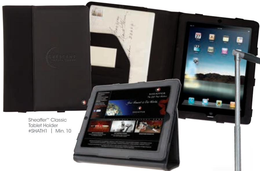
Sheaffer™ Classic Tablet Holder #SHATH1 | Min. 10

Sheaffer® VFM | #VFM | Min. 25 #VFM $10.00 (A) was $12.60(B) #SHAB1 $56.99 (C) was $88.16(B)